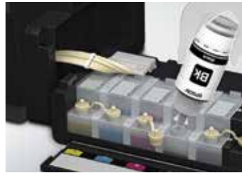
Specially fitted tubes ensure reliable ink flow without leakage

Epson's original ink tank system is designed for smooth, no-mess operation in corporate and SOHO environments.