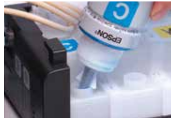
Smart tip design for easy, mess-free refills